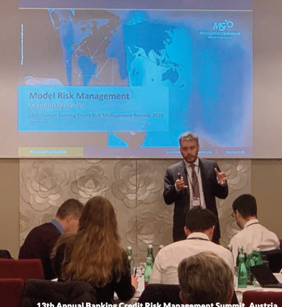
13th Annual Banking Credit Risk Management Summi . Austria

We implement an ongoing program of outreach activities and participation in specialized forums